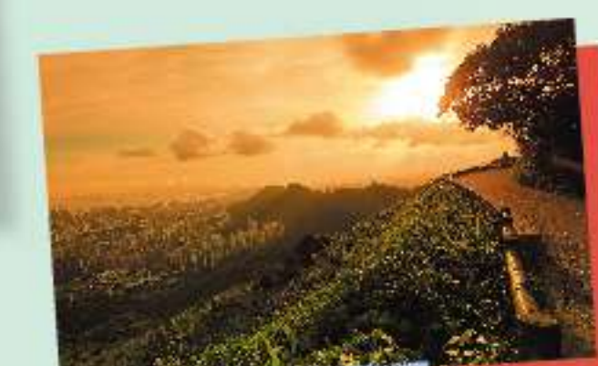
飛鵝山日落 Sunset on Kowloon Peak

The 602-metre high Kowloon Peak is the highest peak in Kowloon and an ideal place for visitors to appreciate the stunning sunset, the tranquil Sai Kung and dazzling night scene of Victoria Harbour, with high rises in the distance looking like tiny toy bricks. Sea of clouds here offers you another poetic view.