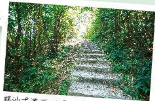
慈沙古道 Tsz Sha Ancient Trail

獅子山和馬鞍山形態有如獅子和馬鞍，故名。這兩個郊野公園均與民居近在咫尺，在高峰上極目遠眺，別有一番天涯若比鄰之感。走到清水灣郊野公園，看到驚濤拍岸，又有如置身天涯海角。這三個郊野公園均是觀光郊遊和攝影熱點。