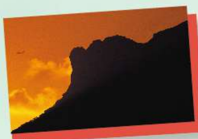
獅子山 Lion Rock

高495米的獅子山是香港著名地標，山嶺崖石嶙峋，形如獅子俯伏，雄視香江，見證着香港由漁村演變成國際大都會，不論是獅子山下人家、或是登峰俯視香江美景的遊人，均對這山有着濃濃之情。