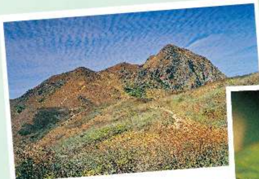
馬鞍山 Ma On Shan

Renowned mountains here include Ma On Shan, the Hunch Backs, Pyramid Hill, Tate's Cairn and Kowloon Peak. They are close to dwellings and easily accessible and thus are ideal choices for hikers and photographers.