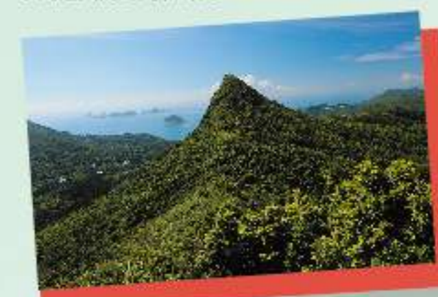
釣魚翁頂峰 Summit of High Junk Peak

西貢有三個尖頂的山峰，稱為西貢三尖，高344米的釣魚翁山便是三尖之一。此山上漁翁見證了山脊的一邊將軍澳的密集發展，另一邊是清水灣迷人的海灣和岬角。