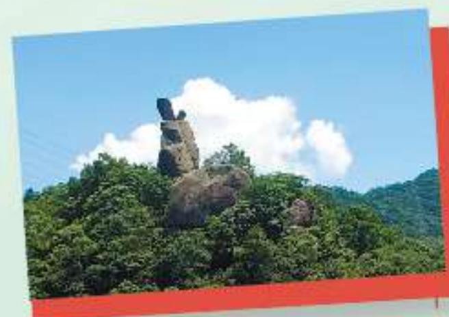
望夫石 Amah Rock

Legend has it that a woman, carrying her child, climbed the mountain every day regardless of the weather, in the hope of the return of her husband who went out for making a living. Unfortunately, her husband never came back, and the woman and her child eventually turned into this Amah Rock. The woman's deep love for her husband moved visitors.