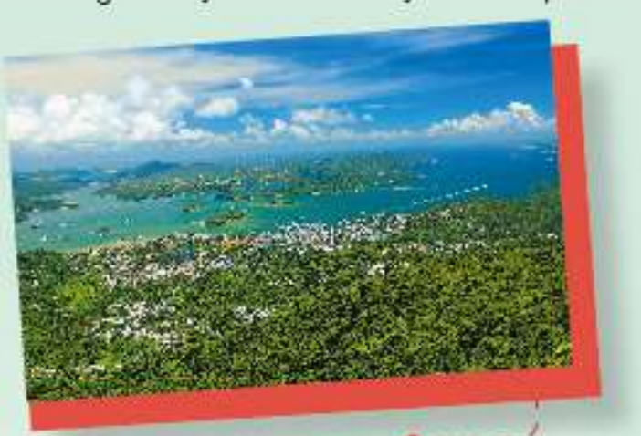
大金鐘看西貢 View of Sai Kung From Pyramid Hill

Resembling a pyramid in shape, Pyramid Hill erectly towers on Ngong Ping Plateau in Sai Kung. The trail looks like a dragon, forming a walkway in the air. The spacious plains nearby are covered in green grass in summer while carpeted in brown in winter. You may feel like being in a fairy tale world when you visit the place.