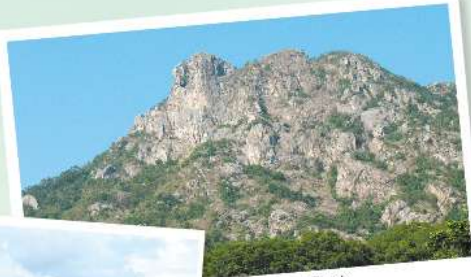
獅子山 Lion Rock