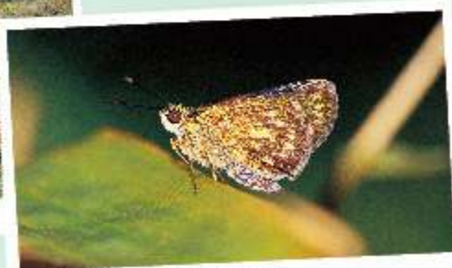
稻耐弄蝶 Beggar's Ace