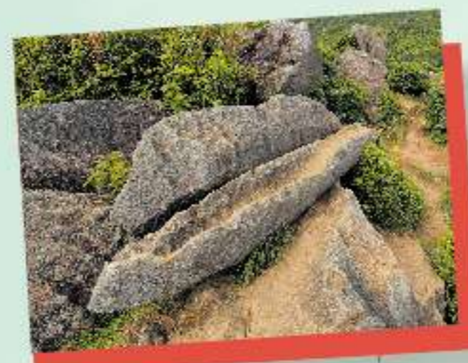
獨木舟石 Canoe Rock