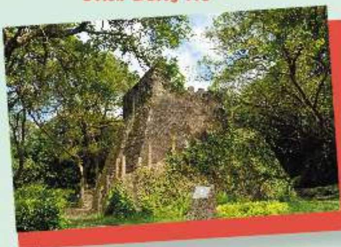
水浪高觀星台 Shui Long Wo Star Lookout

此處遠離摩肩接踵的繁華鬧市，沒有千家萬戶的璀璨燈火，卻有閃爍繁星照耀大地。偶有流星劃破靜寂的夜空，令露營人士雀躍萬分。水浪窩設有觀星台，是露營觀星的不二之選。