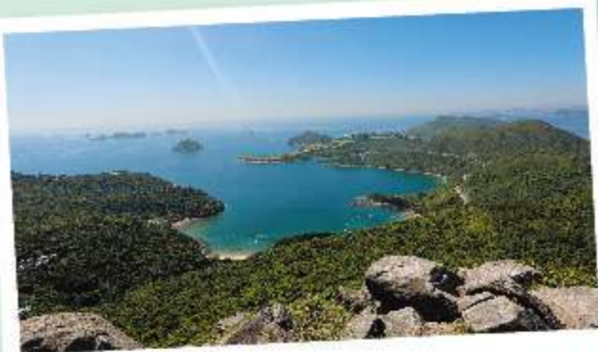
釣魚翁遠眺布袋澳 Overlooking Po Toi O from High Junk Peak

The Clear Water Bay Country Park, renowned for its tranquil and beautiful coastal scenery, is one of the most popular destinations for outdoor activities. Famous scenic spots include Tai Au Mun, Tai Leng Tung and High Junk Peak.