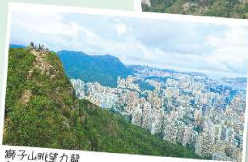
獅子山眺望九龍 Overlooking Kowloon from Lion Rock

The famous scenic spots, including the towering Lion Rock and Amah Rock which have a deeply moving story are popular destinations among hikers and amateur landscape photographers.