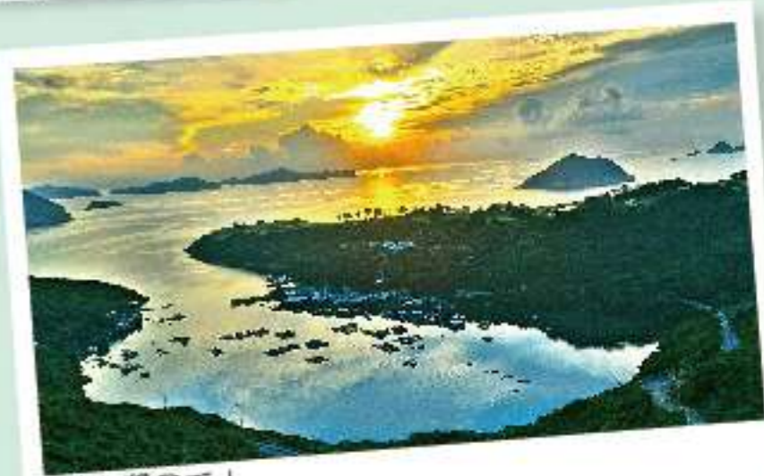
清水灣田下山 Tin Ha Shan in Clear Water Bay

以寧靜優美的沿岸風光馳名的清水灣郊野公園，是最受歡迎的戶外郊遊地點之一，著名景點包括大坳門、大嶺峒和釣魚翁山等。