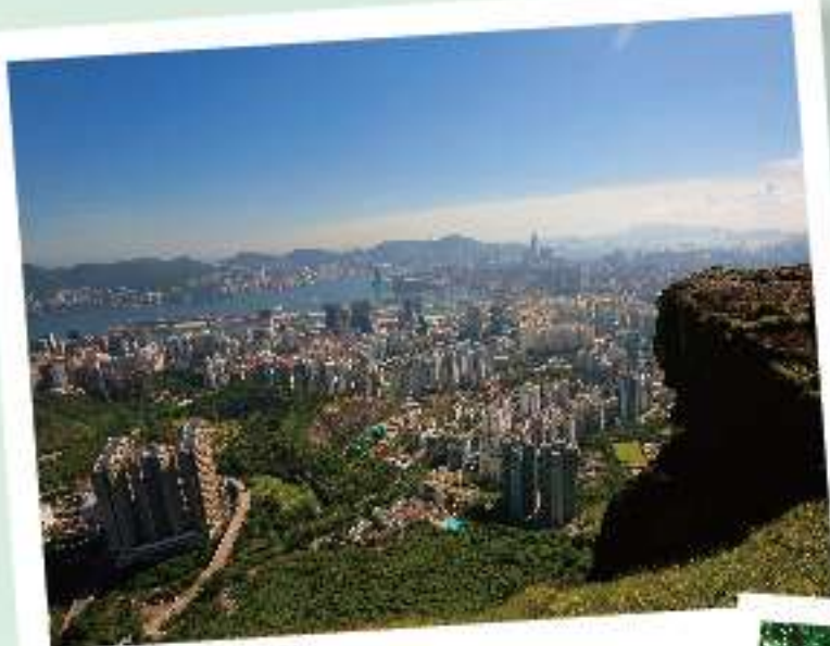
獅子山眺望九龍 Kowloon overlooked from Lion Rock

Lion Rock and Ma On Shan look like a lion and a saddle respectively, hence the names. As the two country parks are close to dwellings, their peaks provide a grand view which makes you feel the world is so small, while Clear Water Bay Country Park gives you a sense of being at the ends of the Earth. The three country parks above are hot spots for outing and photography.