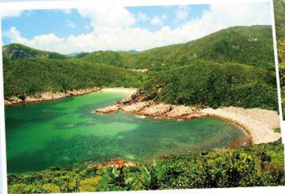
百勝仔 Tak Lap Tsai

It is a country park with the most bays. Famous attractions here include Four Bays of Tai Long Wan, Long Ke Wan, the magnificent High Island Reservoir, Po Pin Chau, Fa Shan and Luk Wu. It is an ideal place for a mountain-to-sea outing.