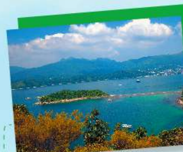
橋咀洲遠足山徑沿途風光 Sceneries along Sharp Island hiking trail

橋咀洲上有一道潮退時才外露的天然沙堤，連接橋咀洲和橋頭島。除了觀看奇異巽石外，亦可取道遠足徑拾級而上，環迴飽覽西貢風光，包括滯西洲、萬宜水庫、果洲群島。適逢天朗氣清，遊人甚至可遠眺將軍澳及馬鞍山。