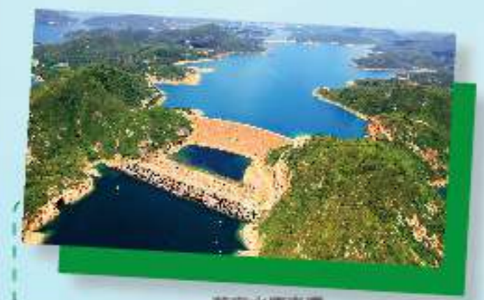
萬宜水庫東壩 High Island Reservoir East Dam

於一九七九年落成的萬宜水庫是香港儲水量最大的水塘。當年，官門海峽東西兩端築了兩條堤壩，以連接西貢半島及糧船灣洲，並截流海水。現時萬宜水庫已成為遠足、水上活動、觀星、看日出及欣賞世界級地質景觀的熱點。