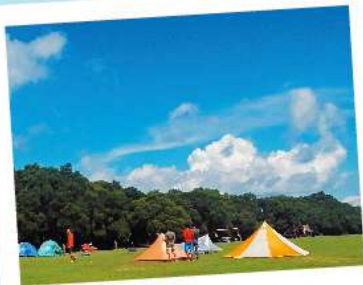
灣仔 Wan Tsai

Sai Kung West (Wan Tsai Extension) Country Park