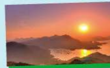
從石屋山觀賞吐露港日落 Sunset over Tolo Harbour from Shek Uk Shan

海拔481米的石屋山，是西貢郊野公園內最高的山峰，山上景色開揚，能盡覽馬鞍山、企嶺下海、吐露港、赤門海峽、船灣淡水湖、八仙嶺、海下灣及蚺蛇尖的景色；由於山峰西面視線全無遮擋，是觀賞及拍攝日落的絕佳景點。