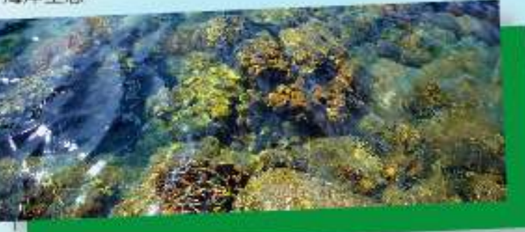
退潮時岸邊的珊瑚群落 Coral communities at the shore during low tide

海下灣有三寶，一寶是岸邊的一塊「東風石」，據聞一旦戴響了這塊石，三日後必起東風，故名。二寶是一個過百年的灰窰，見證昔日西貢一帶燒灰業的興衰。三寶是海下灣的海中綠洲—珊瑚群落，遊人可在星期日及公眾假期參加海岸公園生態導遊，了解海岸生態。