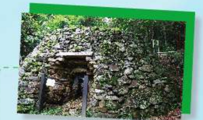
灰窰 Lime Kiln

西貢沿海珊瑚量豐饒，黃姓客家人在上窩建村，採珊瑚並建窰燒造殼灰，作灰泥及肥田料之用而致富。第二次世界大戰後英泥及造磚行業盛行，致窰燒工業沒落。仍屹立於蒼茫山影中的上窩村及灰窰，早已人去樓空，現列為法定古蹟，供遊人參觀。