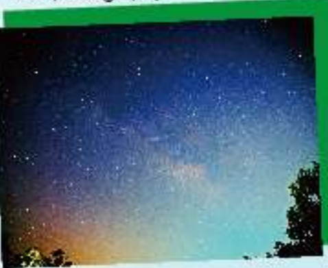
北潭涌的星空 Starry sky at Pak Tam Chung

The Pak Tam Chung Barbecue Site No.2 and the Wan Tsai West Campsite are vast and easily accessible with low level of light pollution, the places are great for shutterbugs making their first try at star photography.