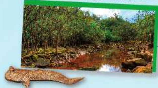
榕樹澳的紅樹林 Mangrove at Yung Shue O

既想親親水筆仔、木樨及樓李等有趣的紅樹，又想近距離觀察潮間帶生物，例如擁有大小不一蟹的招潮蟹、出水能跳的彈塗魚、經常揮動雙蟹的角眼切腹蟹等，到榕樹澳、海下灣、赤徑和上窩遊一圈，一定令你樂而忘返。