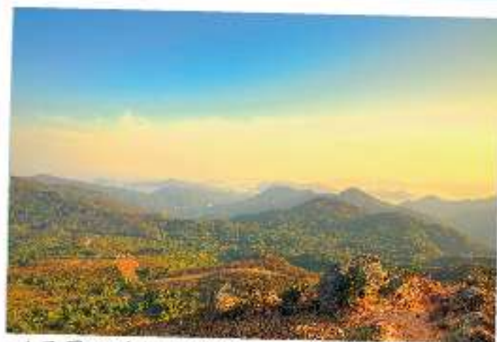
由石屋山遠眺南方群山及西貢海 Viewing mountains in the south and Sai Kung Hoi from Shek Uk Shan