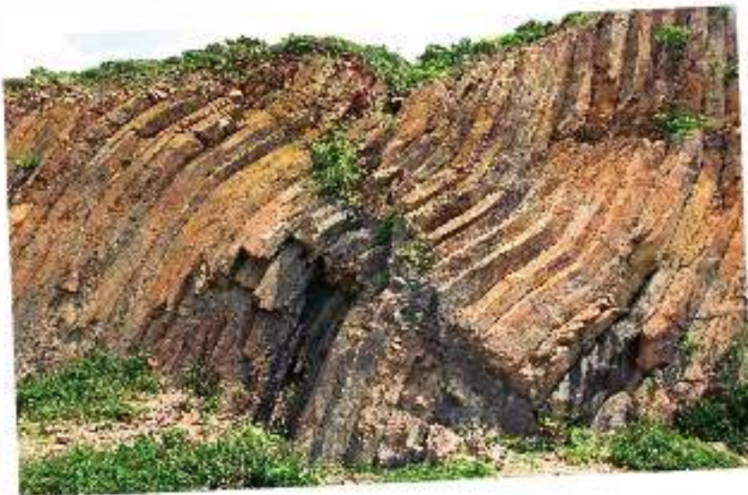
六角柱石 Hexagonal Volcanic Columns

Sai Kung, reputed for beautiful mountains and seas, comprises four country parks covering 7717 hectares, it is a place of natural beauty, like splendid geological landscape, beaches of crystal clear water and silvery sand as well as vibrant mudflats. Mountains and seas here never cease to amaze nature lovers all the year round.