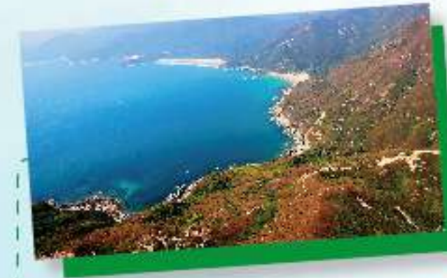
大浪灣(從左至右:西灣、鹹田灣、大灣及東灣) Tai Long Wan (From left to right: Sai Wan, Ham Tin Wan, Tai Wan and Tung Wan)

大浪灣由西灣、鹹田灣、大灣及東灣組成，有香港最美麗海灘之譽。附近的浪茄灣和白腊灣更是水清沙幼，讓人仿如置身馬爾代夫。部分海灣設有露營地點，在蔚藍的海灣旁一邊傾聽天涯樂韻、一邊觀看天際星河，令人樂而忘返。