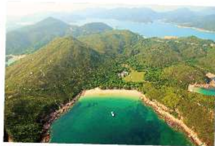
萬宜水庫及百勝一帶 Along High Island Reservoir and Pak Lap

以山海美見稱的西貢共有四個郊野公園，共佔地7717公頃。區內自然景觀豐富，既有壯麗的地質地貌，又有水清沙幼的海灘，還有生機勃勃的泥灘，不論是登山或下海，一年四季均能為喜愛大自然的人士帶來驚喜。